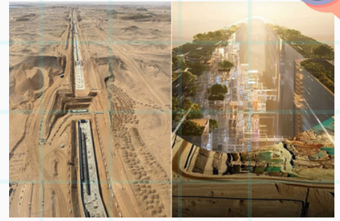
What The Line looks like in 2025

Use precise examples from the documents to justify your answers.