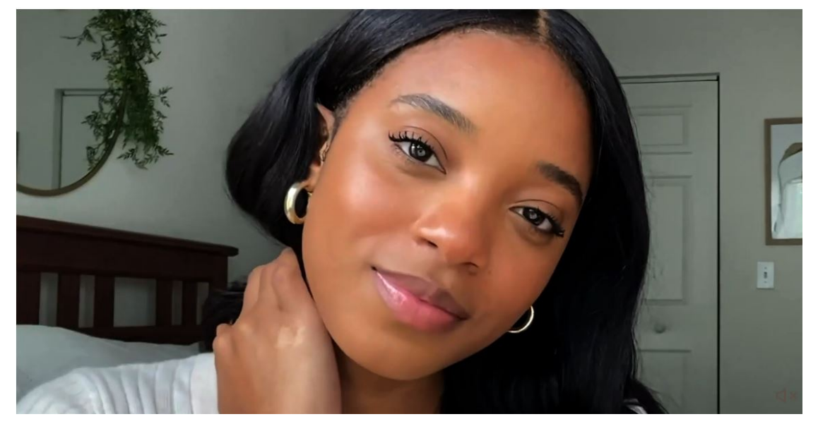
Doc 5 Visuals of the website with 2 models