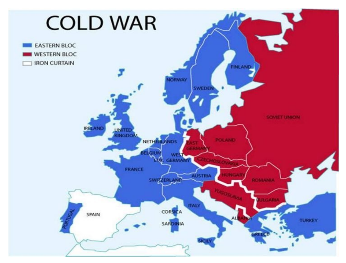
Cold War Map - From 1945 to 1961 thinglink.com