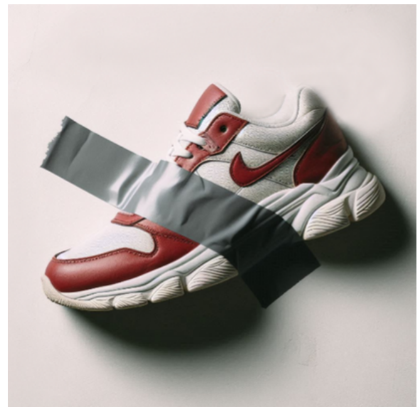
"Actor", Maurizio Cattelan, 2024