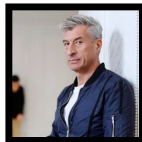
THE ARTIST : MAURIZIO CATTELAN

The new project in question a Nike shoe taped on a white wall with gray tape just like the previous one. The shoe is initially sold at $75 and the artist affirms the tape was bought in a Target in Los Angeles, for this reason the artwork should not be sold over $80 but social networks are already hitting again. Maurizio Cattelan published this new piece named " Actor " and claims being extremely proud of how it illustrates perfectly our society based on capitalism. He wanted to represent how our over-consumption and a sedentary lifestyle can affect the world with pollution and ourselves because moving is healthy unlike staying inside too much time and not even moving to do any activities. The artwork is just reveal and speculations about her future price are already flying.