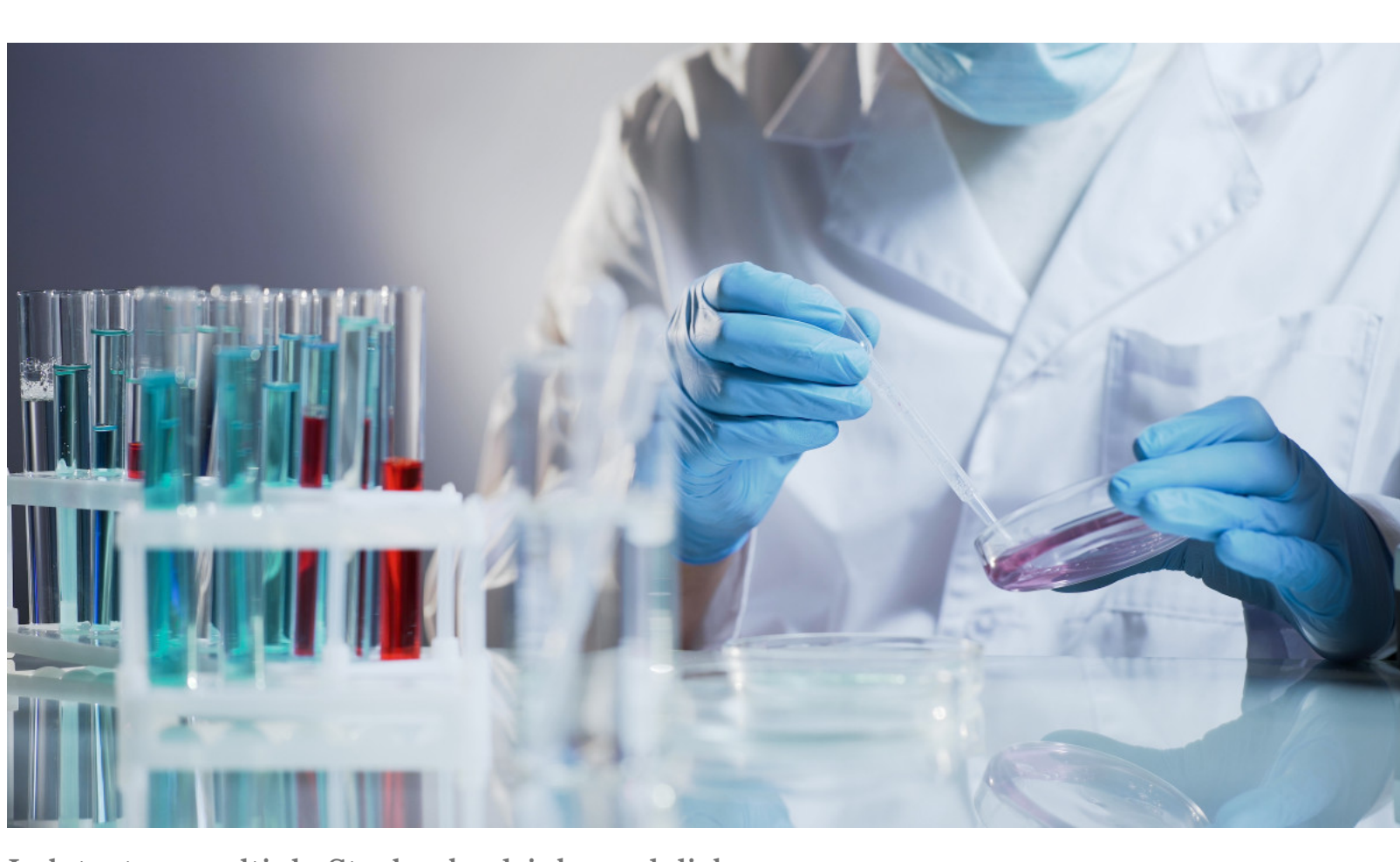
Lab test on multiple Starbucks drinks and dishes. Clean Water Alliance