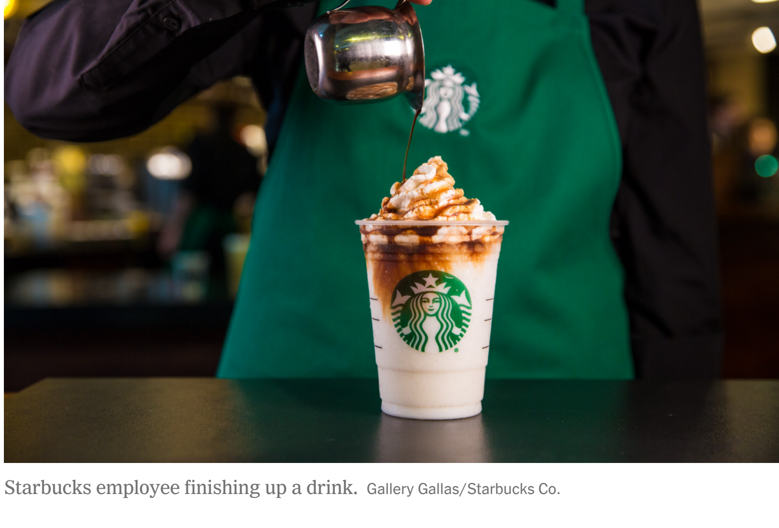
Starbucks employee finishing up a drink.